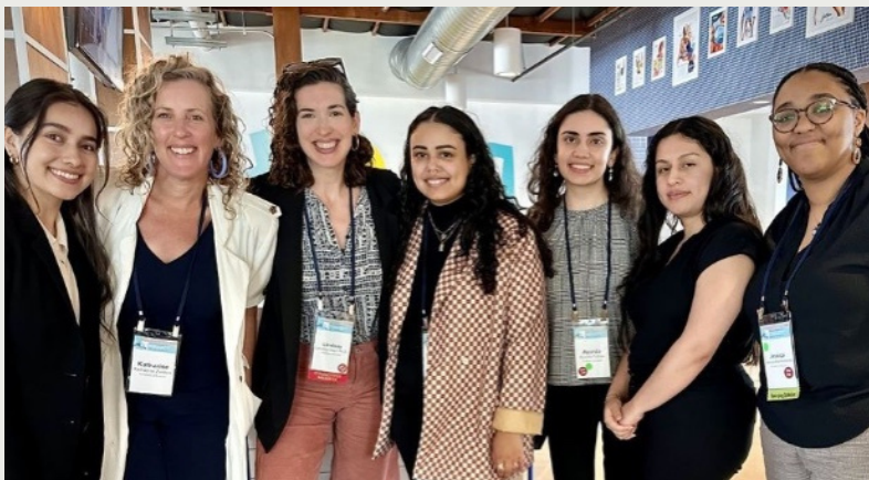
FMI-affiliated faculty and students presented posters at the SRA 2023 Annual Meeting: Keeping Pace with a Changing World.